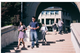
50 years later: UC Berkeley hosts conference reflecting on 1968 race report