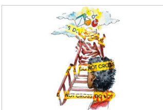
We need more Black people in STEM research